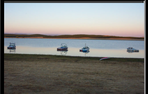
They're just around the corner