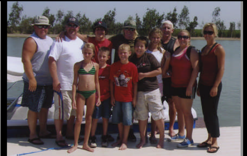
Oh, how we count the days